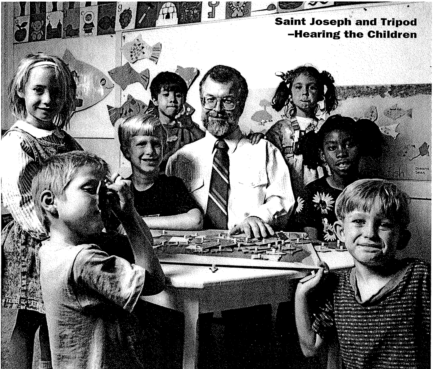
Saint Joseph and Tripod -Hearing the Children